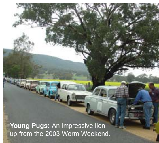
Young Pugs: An impressive lion up from the 2003 Worm Weekend.

The dam there was used to store water for the steam trains that have long since ceased to run on the line.