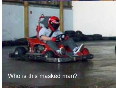
Who is this masked man?