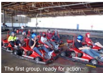
The first group, ready for action