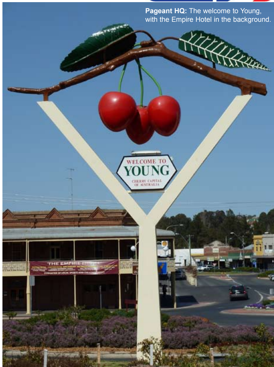
Pageant HQ: The welcome to Young, with the Empire Hotel in the background.

A nice evening meal has been arranged at the Empire Hotel, which is opposite the Visitor Centre. The hotel is an easy walk from the motels where most, if not all, people will be staying.